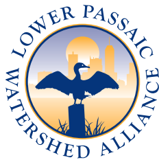
New logo design for sponsoring agency